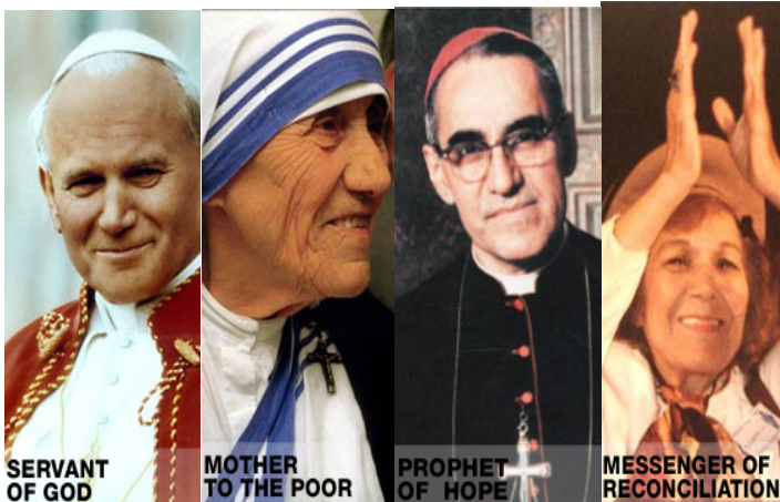
SERVANT OF GOD

For more information, go to www.cth2009.org , conf_info@cth2009 or call 713-391-2609.